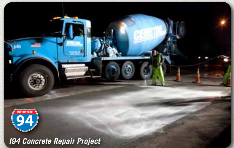
194 Concrete Repair Project