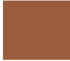
Honey Crisp CPC108L