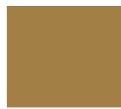
Morchella Gold CPC144L