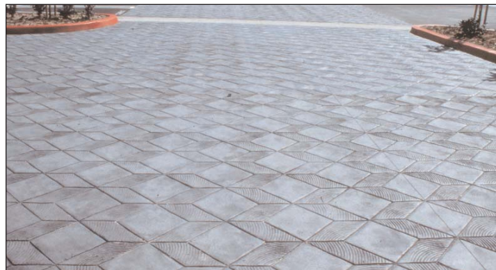
Concrete parking delivers versatility: Concrete surfaces can be placed with an array of textures, shapes, patterns and colors.