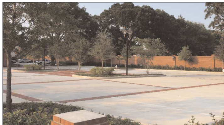
Concrete parking delivers all-around value: Concrete parking offers competitive initial costs and is virtually maintenance free.

Concrete Delivers Engineered concrete solutions for sustainability, durability and value.