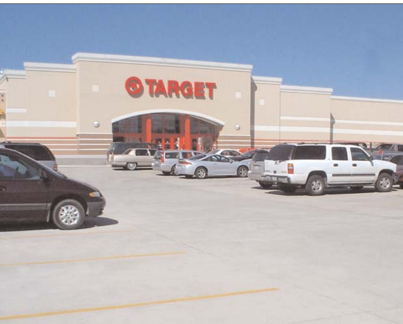
Concrete parking delivers curb appeal: Bright, white concrete enhances any property. Plus, increased reflectivity can lower cooling and lighting costs.

Concrete parking areas pay for themselves in the short term, then deliver long-term savings. Compared to asphalt: