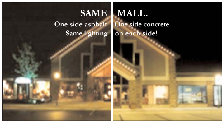
Concrete parking delivers enhanced safety: With three times the reflectivity of asphalt, concrete parking requires less lighting, reducing costs by up to 30%, while providing enhanced safety.