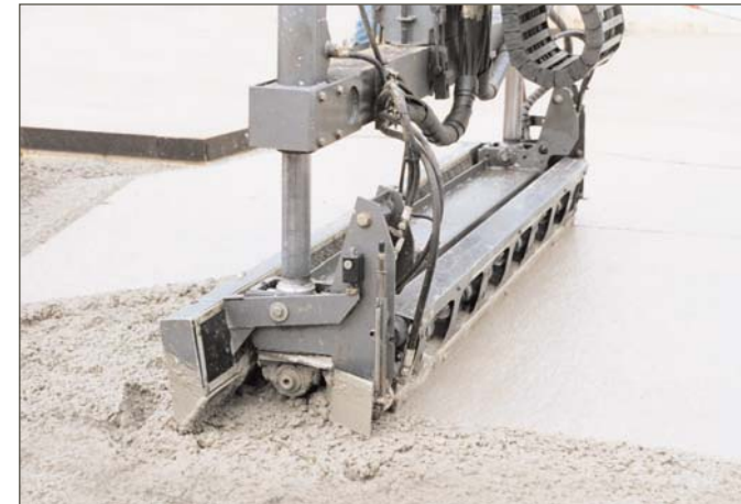
Concrete parking delivers speed and lower installed cost: Concrete pavement technology is continually improving. Laser screeds speed up placement time, improve accuracy and reduce labor costs.

Concrete paving technology continues to advance, making concrete construction quicker and more of a value than ever. Innovations such as slipform paving machines offer the highest production rates of any construction method and yield uniform, durable surfaces. Advanced finishing methods like laser screeding combine precision and speed to lower installed costs and produce the highest quality results.